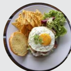
Gourmet Beef Burger