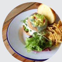
Crab Meat Burger