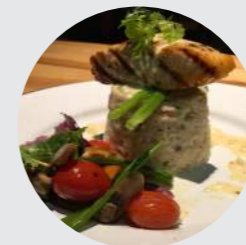
Grilled Salmon and Pilaf Rice